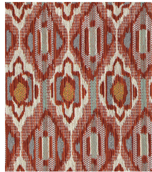
Terra Cotta 1012661