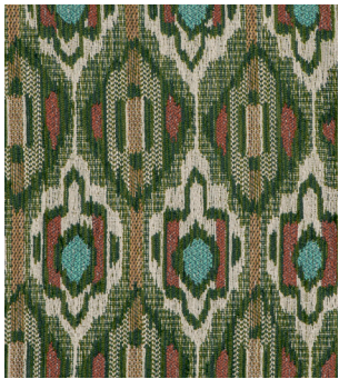
Prickly Pear 1012658