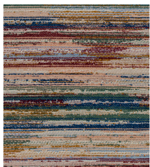
Midnight Sun 1012653