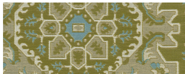
English Garden 1011317