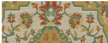
Potters Wheel 1011318