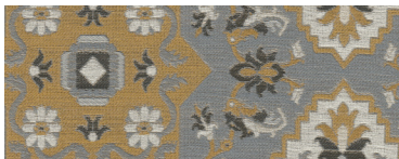
Wrought Iron 1011324