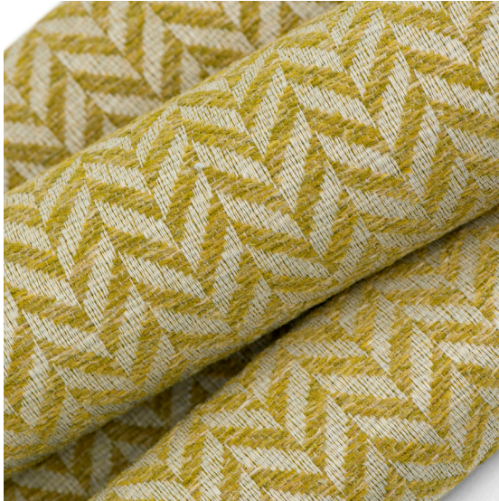
Repeats Not Shown to Scale.