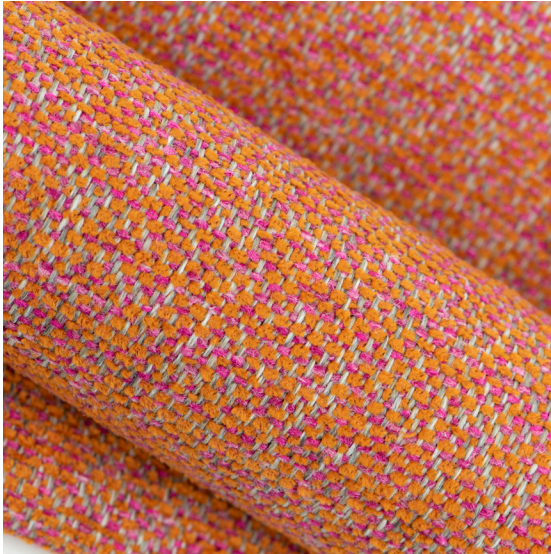
Repeats Not Shown to Scale.