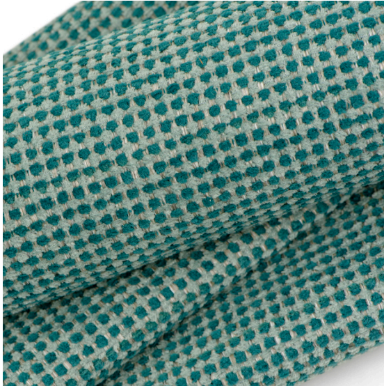
Repeats Not Shown to Scale.